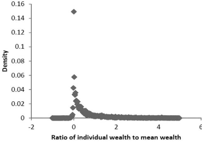
FIGURE 2. The empirical distribution of wealth. The horizontal axis represents the ratio of individual wealth to the mean wealth of the economy; the mean of this ratio equals 1.